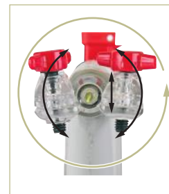
Swivel and adjustable claw